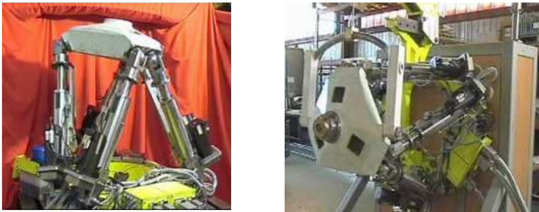
Figure 2. The CMW300

The study of the direct geometrical model is a recurrent activity for several members of the project. One can say that the progress carried out in this field illustrates perfectly the evolution of the methods for the resolution of algebraic systems. The interest carried on this subject is old. The first work in which the members of the project took part in primarily concerned the study of the number of (complex) solutions of the problem [71], [70]. The results were often illustrated by Gröbner bases done with Gb software. One of the remarkable points of this study is certainly the classification suggested in [60]. The next efforts were related to the real roots and the effective computation of the solutions [79]. The studies then continued following the various algorithmic progresses, until the developed tools made possible to solve non-academic problems. In 1999, the various efforts were concretized by an industrial contract with the SME CMW ( Constructions Mécaniques des Vosges-Marioni ) for studying a robot dedicated to machine tools.