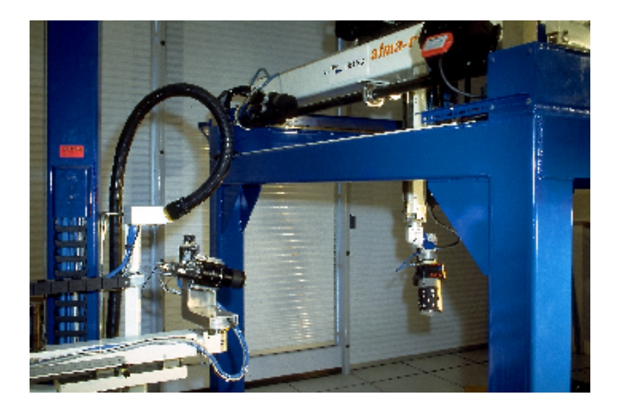
Figure 2. Lagadic robotics platforms for vision-based manipulation

To improve the panel of demonstrations and to highlight our research activities, we have developed a new demonstration that combines 3D model-based visual tracking and visual servoing techniques provided in ViSP (see Section 5.1) to pick up cubes in order to build a tower. One of the challenges was to automate the initial object localization requested to initialize the tracker. At this end we have developed a generic template pose estimation algorithm based on Surf points of interest matched with the corresponding points provided in a database computed offline during a learning step.