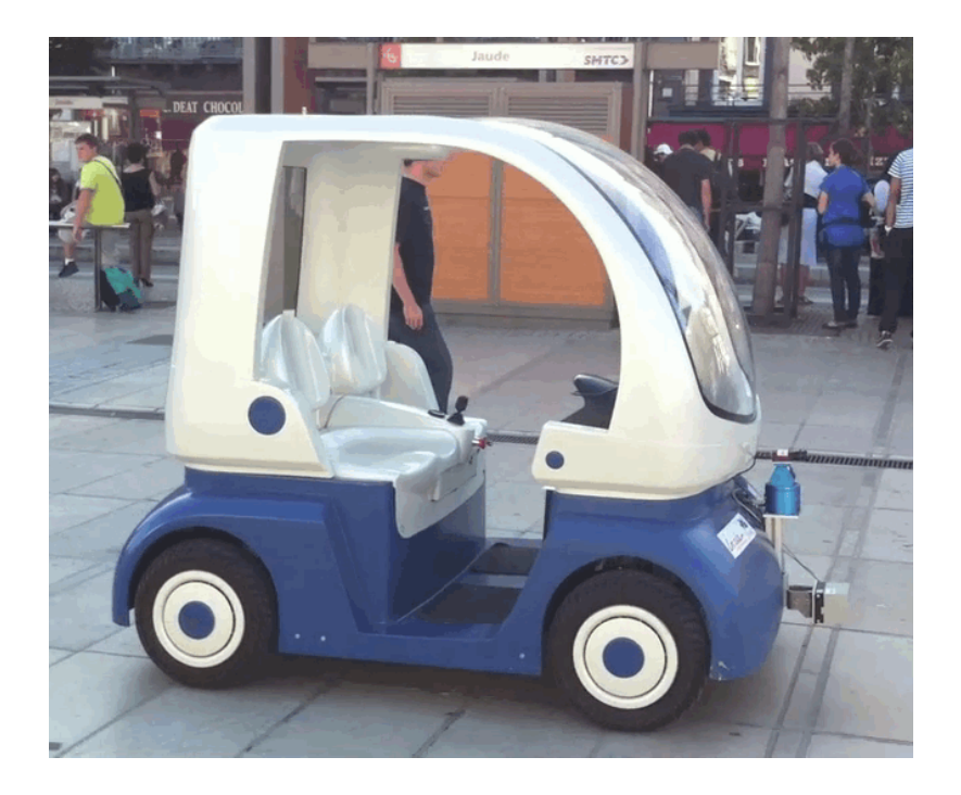
Figure 4. Lagadic Cycab vehicle