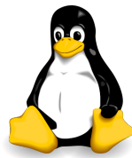
Figure 3. An example of a pdf file