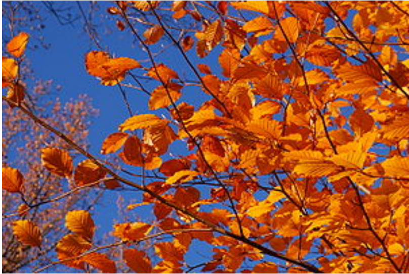
Figure 2. An example of an eps file