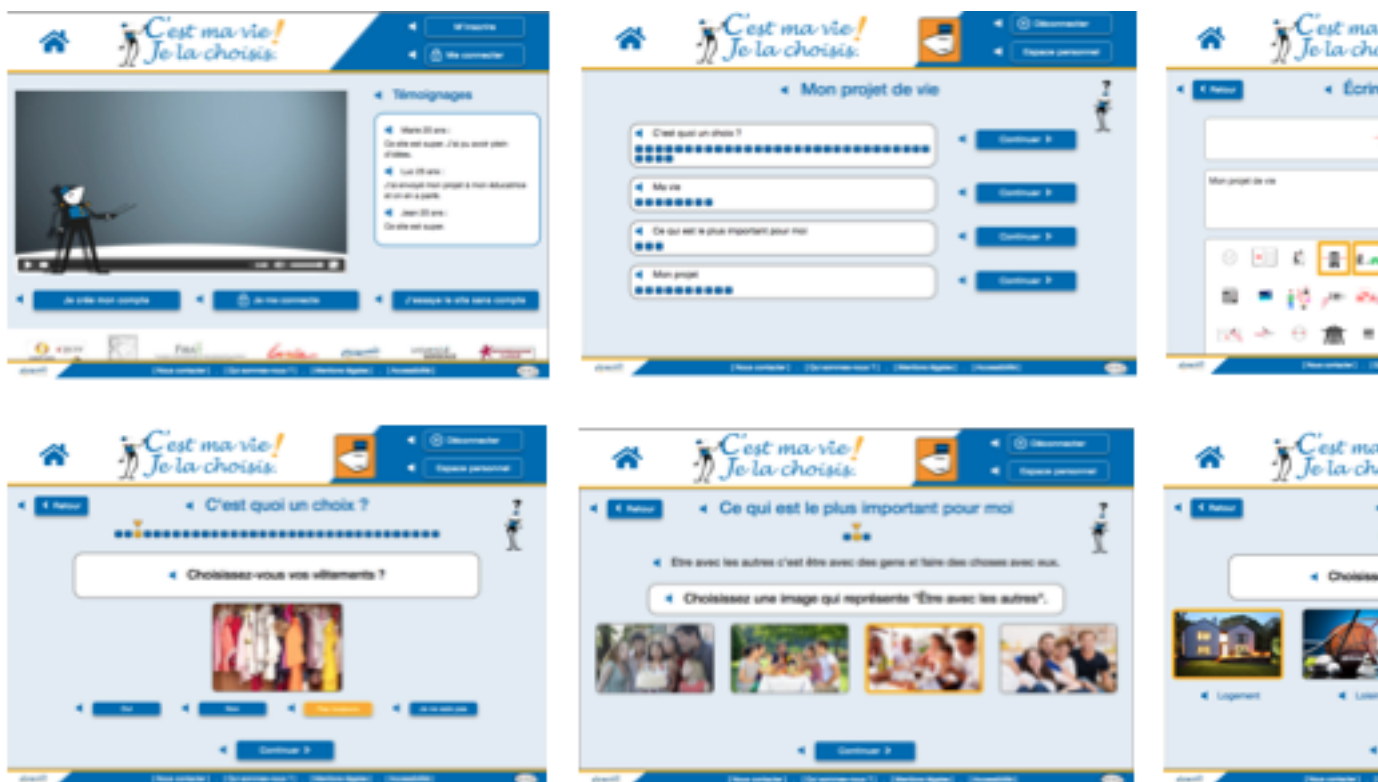
Figure 2. Sample screenshots from the Life Plan website.