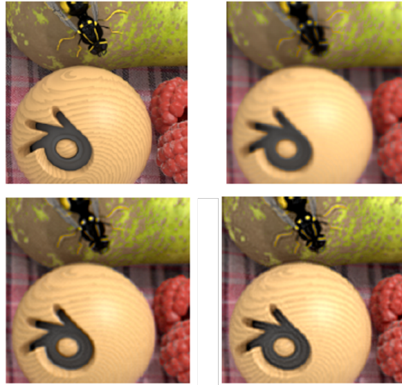
Figure 6. Illustration of some results on a crop of a central view with a magnification factor of 2; Top row: original (left), bicubic interpolation (right); Bottom row: super-resolved with a deep learning technique of the literature (left), super-resolved with the proposed method (right).

This work is currently being extended on one hand by exploring how deep learning techniques can further benefit the scheme, and on the other hand by considering a hybrid system in which a 2D high resolution image, a priori not aligned with the light field views, can guide the light field super-resolution process.