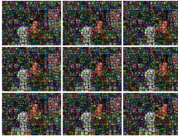
Figure 4. Super-rays for the sparsely sampled light field in the Tsukuba dataset.

Light field acquisition devices allow capturing scenes with unmatched post-processing possibilities. However, the huge amount of high dimensional data poses challenging problems to light field processing in interactive time. In order to enable light field processing with a tractable complexity, we have addressed, in collaboration with Neus Sabater (technicolor) the problem of light field over-segmentation [15]. We have introduced the concept of super-ray, which is a grouping of rays within and across views (see Fig.4), as a key component of a light field processing pipeline. The proposed approach is simple, fast, accurate, easily parallelisable, and does not need a dense depth estimation. We have demonstrated experimentally the efficiency of the proposed approach on real and synthetic datasets, for sparsely and densely sampled light fields. As super-rays capture a coarse scene geometry information, we have also shown how they can be used for real time light field segmentation and correcting refocusing angular aliasing.