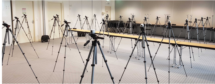
Figure 1. The 40 omnidirectional cameras positioned for an indoor scene capture.

Natural content has been created with Lytro cameras (the original first generation Lytro and the Lytro Illum) and is already available to the community ( https://www.irisa.fr/temics/demos/lightField/CLIM/DataSoftware.html ). The team also owns a R8 Raytrix plenoptic cameras with which still and video contents have been captured. Applications taking advantage of the Raytrix API have been developed to extract views from the Raytrix lightfield. The number of views per frame is configurable and can be set for instance to 3x3 or 9x9 according to the desired sparsity.