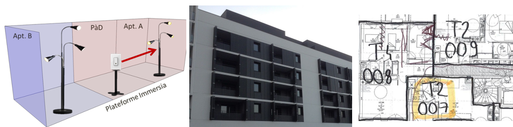
Figure 3. On-demand room real experimentation

consumptions, errors etc. The On-demand room thus constitutes an experimentation platform, where real people live and produce data that can be analyzed for statistical purposes. Produced data could also be used in combination with interviews of the occupants to improve the functionalities of the On-demand room, evaluate acceptance and appropriation.